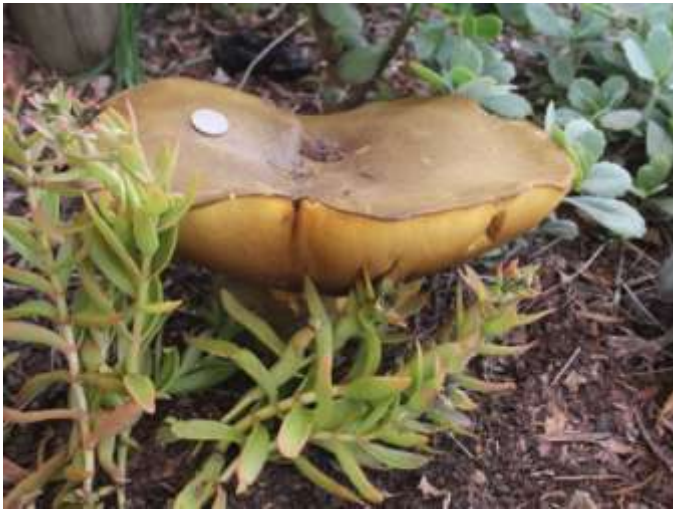
Below: These Boletus have been eaten by woylies