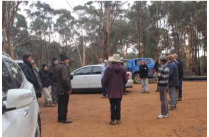
Above: Joining in with the Central South Naturalists Club