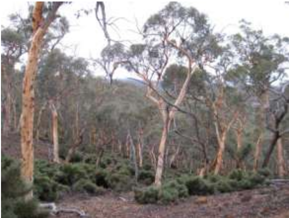
Left: Powder Bark Wandoo woodland

The Dryandra Woodlands are very impressive in their extent, beauty and diversity. They are not comprised of a single block of land but exist as several titles and are interspersed with agricultural land. A major on-going project is to acquire corridors from farm holdings so as to more easily link all parts of the reserve allowing wildlife to range over the whole and thus ensure their on-going survival. Stands of Wandoo, Powder-bark Wandoo, Marri and Mallet are prolific. Other highlights of the day included visiting former sites of tree-top fire look-outs, learning of the uses to which Mallet trees had been put in tanning leather and their being manufactured into handles for axes and other tools. Mallet trees were planted in a plantation in the Dryandra forest during the 1930s Depression as part of a program to give work to the long-term unemployed. We all enjoyed a picnic lunch in a woodland grove.