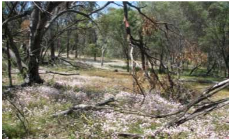
Above: Everlastings in Reserve 19904.