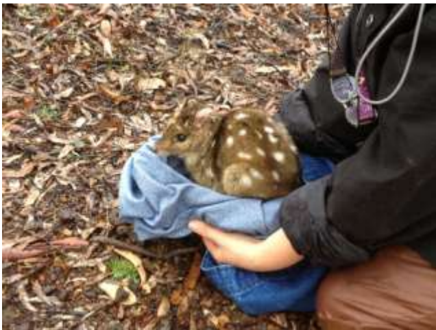
Above: Chudditch trapped during the Julimar Fauna Survey.