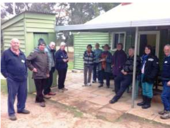
Left: All packed up and ready to leave, after a great weekend.

On Monday morning, after the usual competition for space while preparing our various breakfasts, there was a rapid clean-up of the cottage and loading of vehicles before travelling to Boyagin Rock , some thirty kilometres west of Pingelly, situated in another impressive reserve, one in which camping is permitted. Signage indicated that local Noongar belief was that anyone climbing to the top of the rock without stopping would enjoy a long life. Without naming them, it would seem that we have several members who are likely to be around for a long time yet! It was then time for a quick picnic lunch and heading for home.