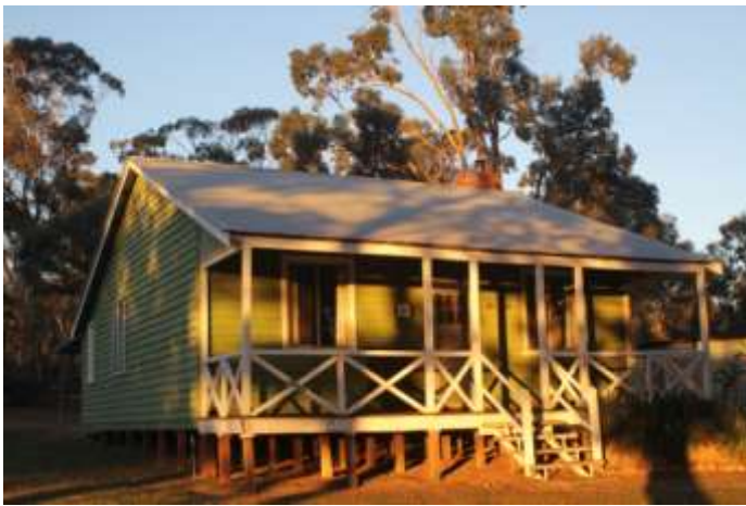
Above: The Lions Village accommodation.

Arriving at the Lions Village, located in the middle of the 28,000 hectare Dryandra Reserve on Saturday, we were greeted by the sight of grey kangaroos grazing peacefully on the cleared oval close to the cottages. After settling in we began our discoveries by following one of the many walk-trails designed to accommodate varying levels of fitness and the length of time walkers have available. We chose the modest Blue Wren Trail as the day was drawing to a close. Cooking for eight in a small kitchen that evening with everyone catering for themselves made for some chaotic close encounters, but also encouraged conviviality so that by the end of the weekend we had all learned some new skills in communal living!