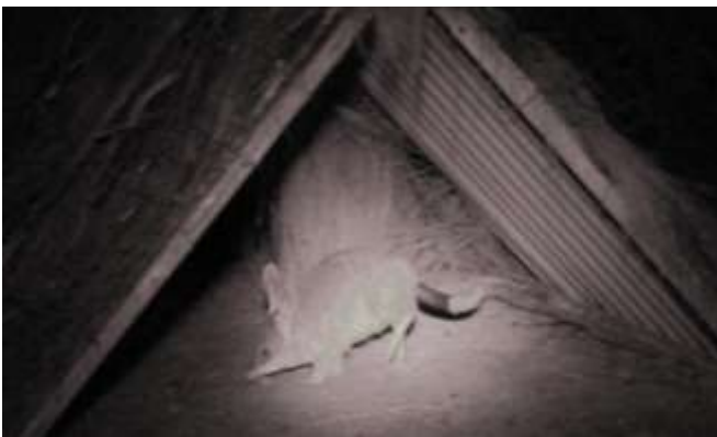
Above: Bilby under a Mia (hutch). [the digital camera has been used to pick it up with the infra-red torch]

Perhaps the major highlight of the whole weekend was our visit on Sunday night to Banda Mia , a wildlife sanctuary in the heart of the forest. Built in 2001, with funds from the Regional Tourism Development Fund and the Department of Conservation and Land Management (CALM), it is part of the Western Shield fauna recovery program. It consists of a fenced enclosure within the forest and an impressive interpretation and education centre designed to represent a burrow. This was constructed by a local builder and has an magnificent stained glass entrance depicting local fauna and flora, also created by a local artist.