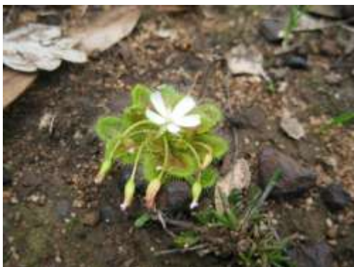
Left: Drosera ramellosa