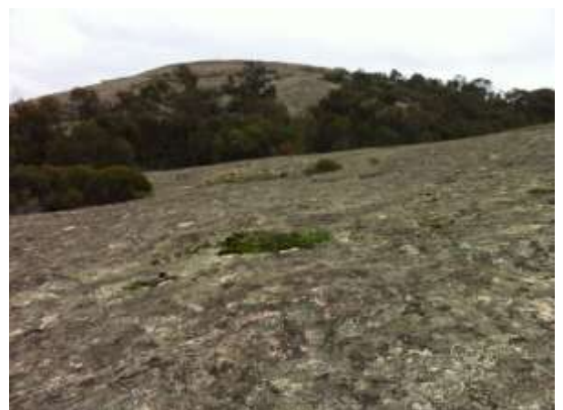
Right: Boyagin Rock towers in the background.