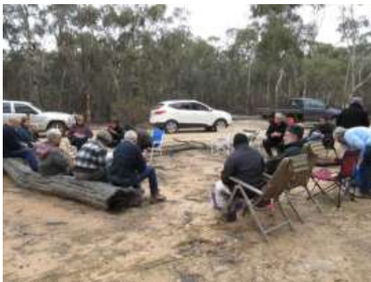
Left: Afternoon tea with the Narrogin Nats

We were given a short power-point introduction by our excellent guide, Lynette Carroll, before being taken via pathways through the bush to four different stations where we sat silently on logs waiting, with illumination provided by animal-friendly red lights, for the stars of the show to appear. These are the endangered species being protected and bred for eventual release into the Dryandra Reserve with the ultimate aim of re-establishing them into what was their natural habitat prior to widespread clearing for agriculture and the introduction of predatory animals. The five threatened species able to be observed at Banda Mia are: the dalgyte or bilby, wurrup or rufus hare-wallaby, marl or western barred bandicoot, boodie or burrowing beetong and the neenine or banded hare-wallaby. Many of us thought the arrival of these animals into the illuminated circle resembled actors coming on stage and they certainly held their audience in rapt and admiring attention. Despite sitting still outside in the increasingly cold evening, we were all sorry when the visit came to an end.